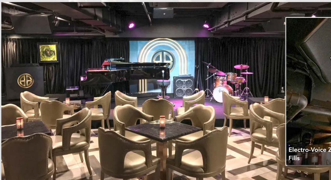
Electro-Voice ZX1i Centre / Delay Fills