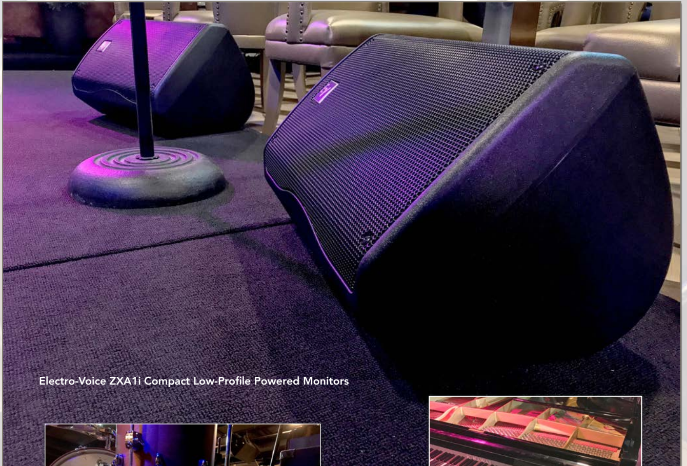
Electro-Voice ZXA1i Compact Low-Profile Powered Monitors

The monitor system comprises of six (6) low-profile Electro-Voice ZXA1 self-powered speakers. The EV eight inch (8inch) "hot-spot monitors" where an ideal choice given the room's space restrictions. They allow for the control of any monitor stage spill into audiences areas, giving a heightened appreciation and a clearer overall audience experience of the stage performance.