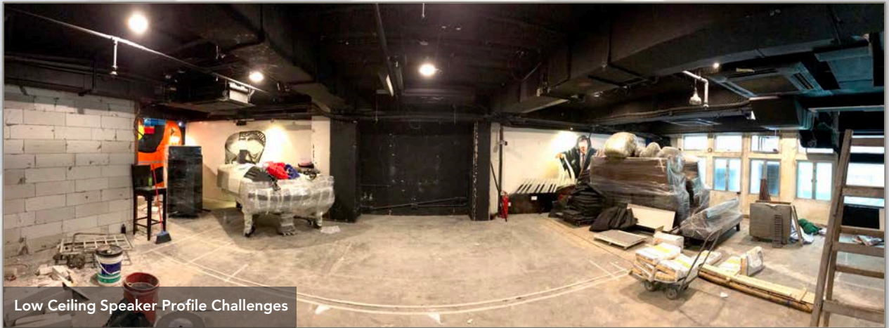
Low Ceiling Speaker Profile Challenges